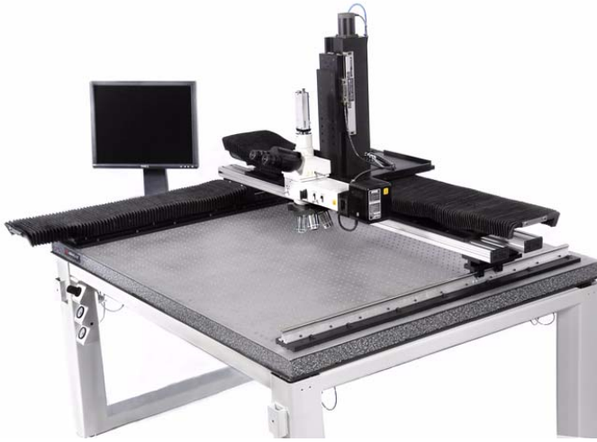
Full-Gantry configuration with vibration isolation table