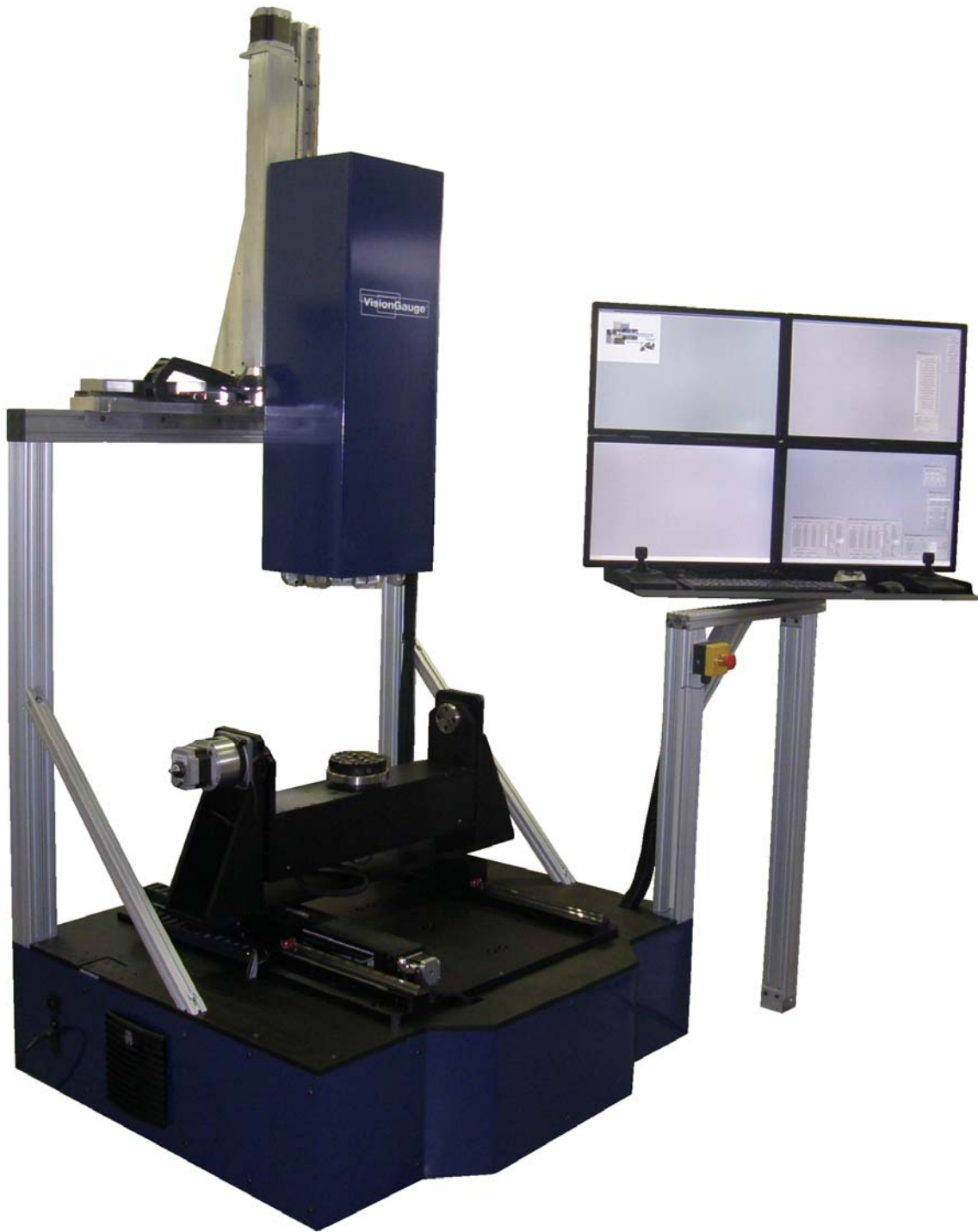
Extended 24" x 24" x 24" travel machine with trunnion configuration for big and heavy parts