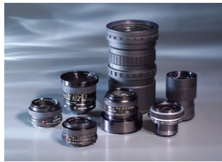
Large Format Lenses