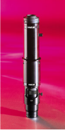
High Magnification Zoom Lenses