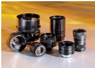
Low Magnification CCTV Video Lenses